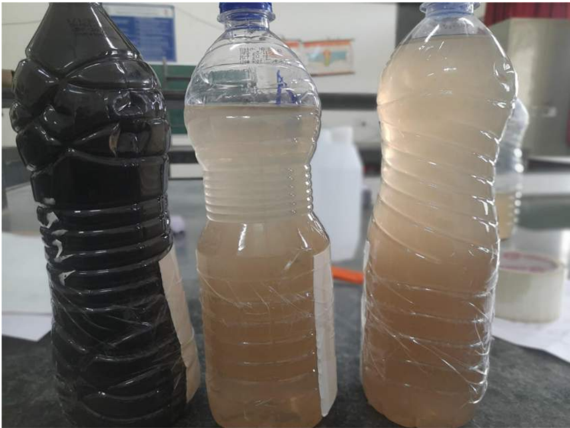
Comparison of raw & treated wastewater