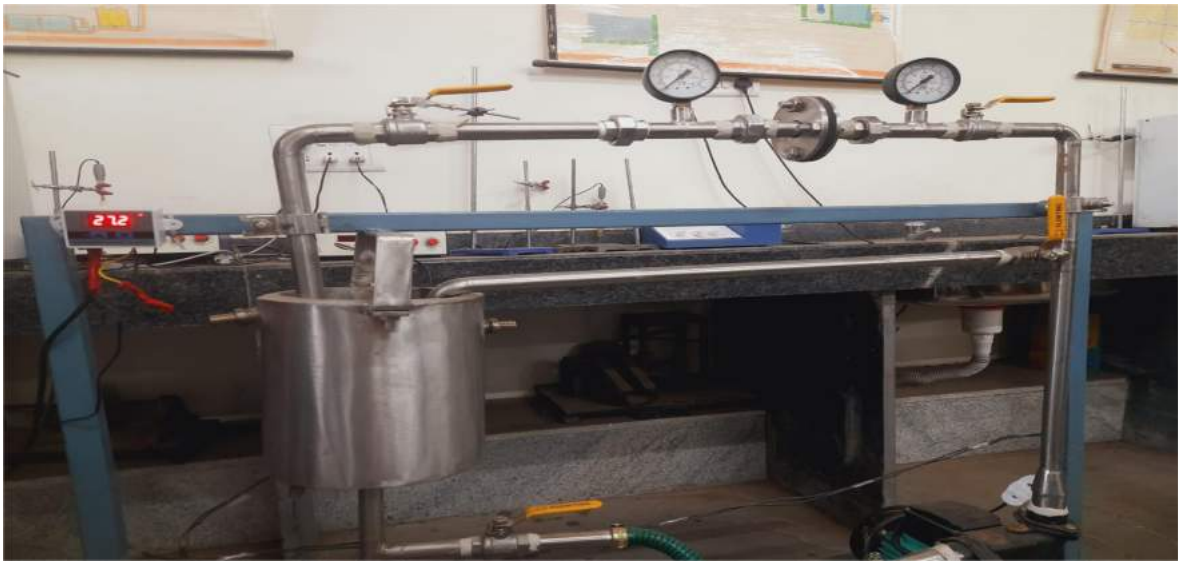
Hydrodynamic cavitation equipment